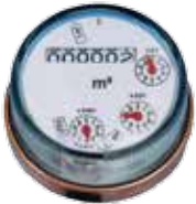
Optical & Reed Pulsers