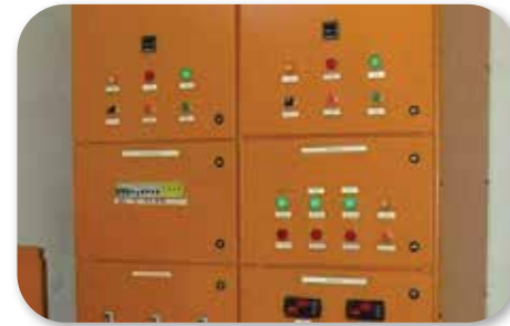
MCC (Control Panel)

All in accordance with international standards and customer's specifications