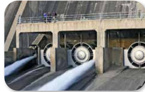
Dams (Screens & Valves)